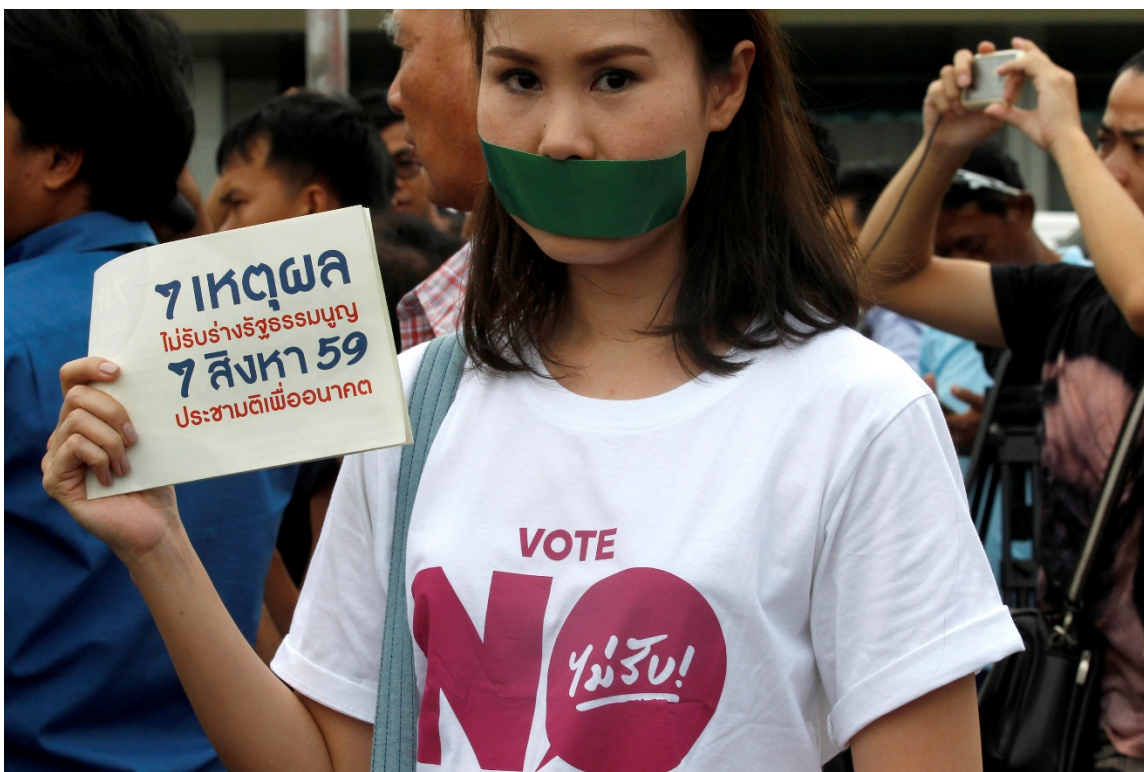
Thai activist Nutta Mahattana protests the junta-backed constitution ahead of the August 7, 2016 referendum in Bangkok, June 15, 2016.