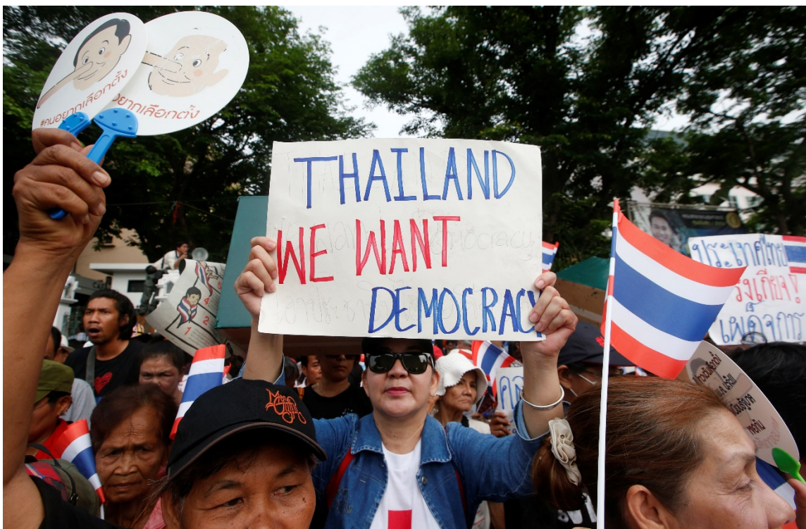
Thai pro-democracy protesters marking the fourth anniversary of the military coup, May 22, 2018.

The police submitted a request for an additional 12 days of detention, but the court released the defendants on bail of 100,000 baht (US$3,285) per person on the condition that each not participate in any political assembly that violates the law and causes danger to the public. 344